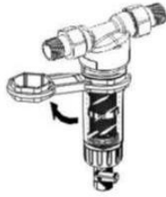
2. Separate bowl