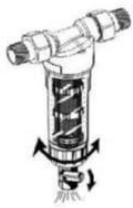
1. Filter rinse