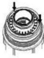
6. Align position